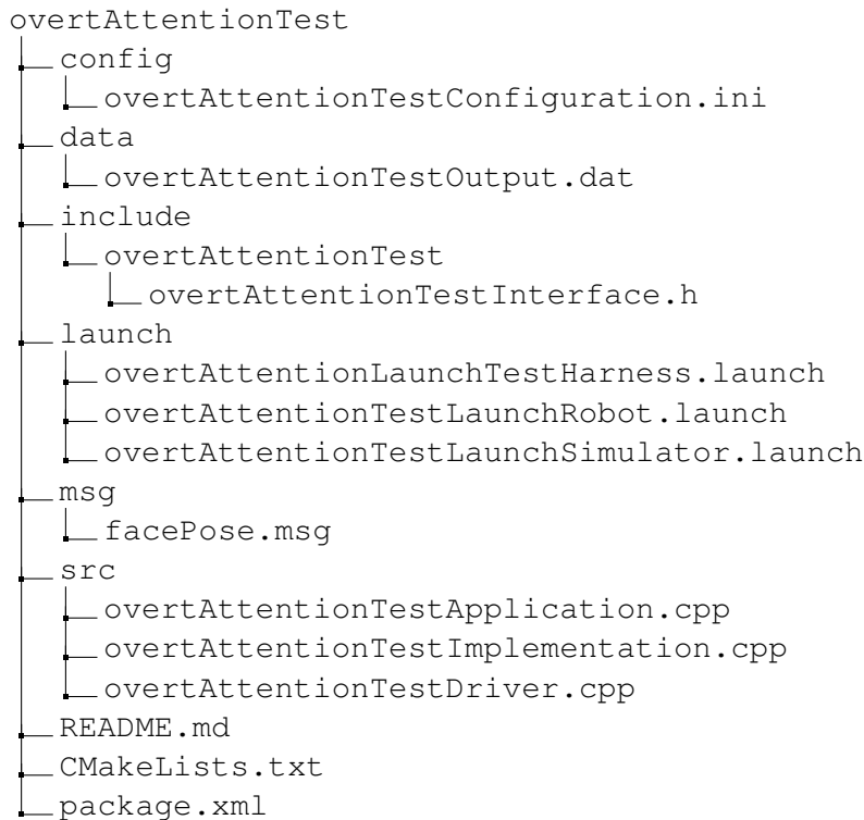
Figure 2: File structure for overAttention unit test

The file structure for the overtAttention unit tests package is as follows: